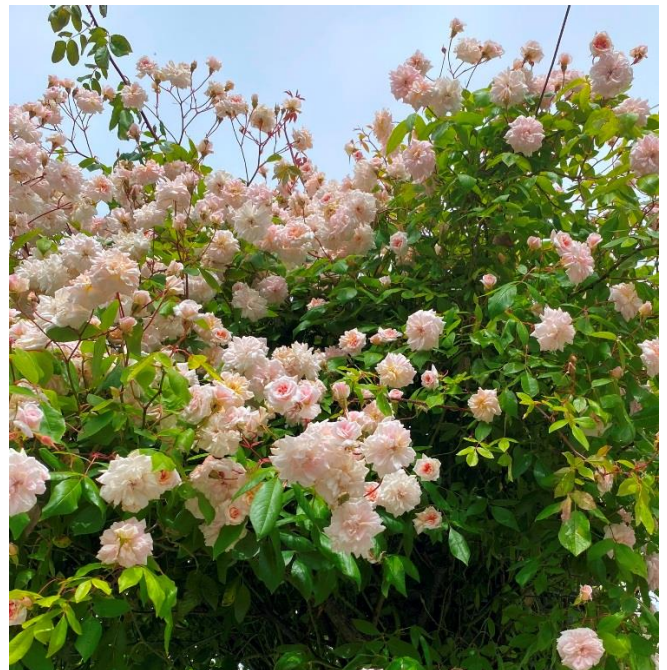
Climbing 'Cecile Brunner'